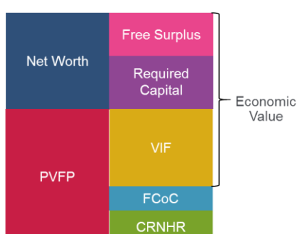
Figure 2: Components of Economic Value

Compared to the level of Solvency II Own Funds, the Solvency II Adjusted Own Funds Approach aims to capture the following additional items that impact the value of existing business: