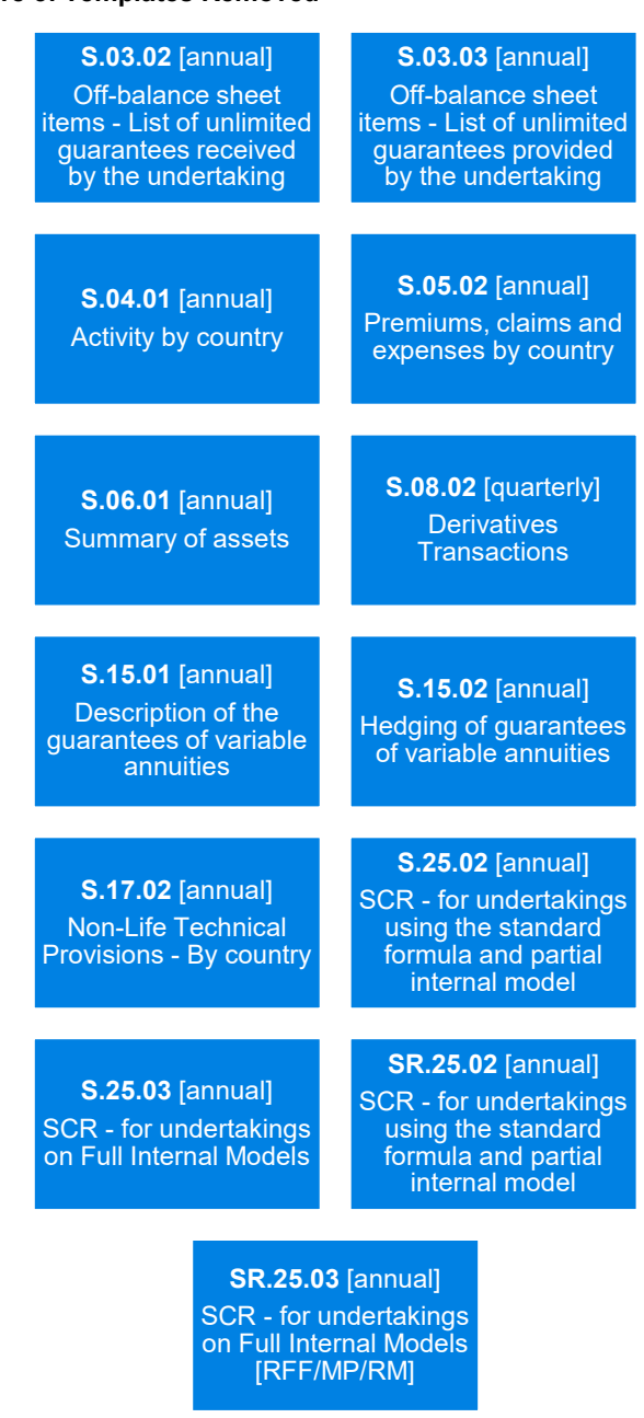
Figure 3: Templates Removed

Figure 3 shows the templates that have been removed.